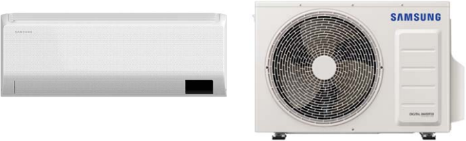
(actual equipment appearance may vary)