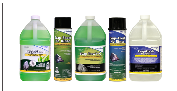
EVAPORATOR COIL CLEANERS