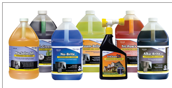
CONDENSER COIL CLEANERS