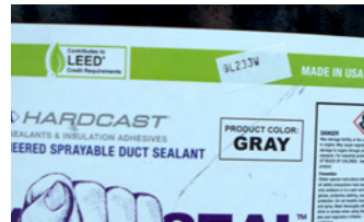
50-Gallon Drum Sealant