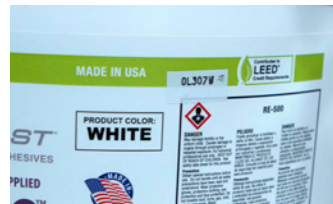
RE-500 5 Gallon

Hardcast provides a large assortment of products to our customers across separate segments of the product spectrum (i.e. water-based sealants, solvent-based sealants, water-based adhesives, solvent-based adhesives, aerosolized adhesives, and a plethora of hardware items). The batch/lot codes on these products will vary by product type and use. This document will address how to decode the batch codes dependent on the product type as well as the expected shelf-life. The accompanying pictures will give you the visual needed should you ever need to obtain a batch/lot code for review.