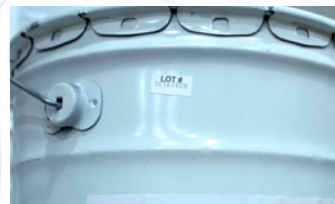
5 Gallon Adhesive