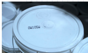
2 Gallon Sealant