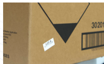
Solvent Cartridge Case