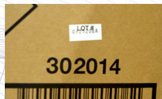
Sure-Grip™ 404 Tubes Case