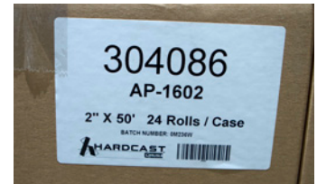
Rolled Sealant Case 2