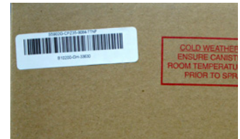
40 lb Aerosol Adhesive