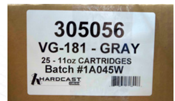
Sealant Cartridge Case