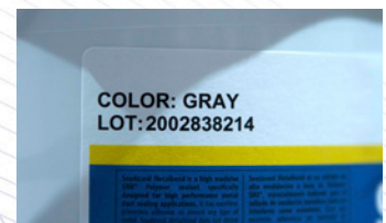
Soudal 4-1 Gallon Carton