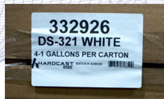
4-1 Gallon Carton 2