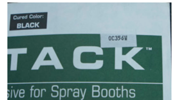
50-Gallon Drum Adhesive