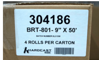
Rolled Sealant Case 1