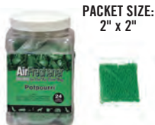
PACKET SIZE: 2" x 2"